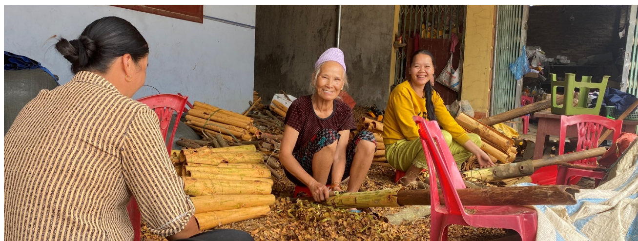
Photo: Primary processing of cinnamon bark by women of Na Po village, Thach An district

The elements of socio-economic sustainability are present in Cao Bang from the point of view that sustainable, mixed production is supported both at (provincial and district) policy level and by the companies DACE and Cha-Do, although they are of course far from being the only interested companies operating in the area. Farmers themselves are broadly aware of the benefits of multiple cropping, whilst primary processing – whether de-barking and drying cinnamon or the drying and sorting of star anise, often conducted by women, also provides an additional source of income to rural communities.