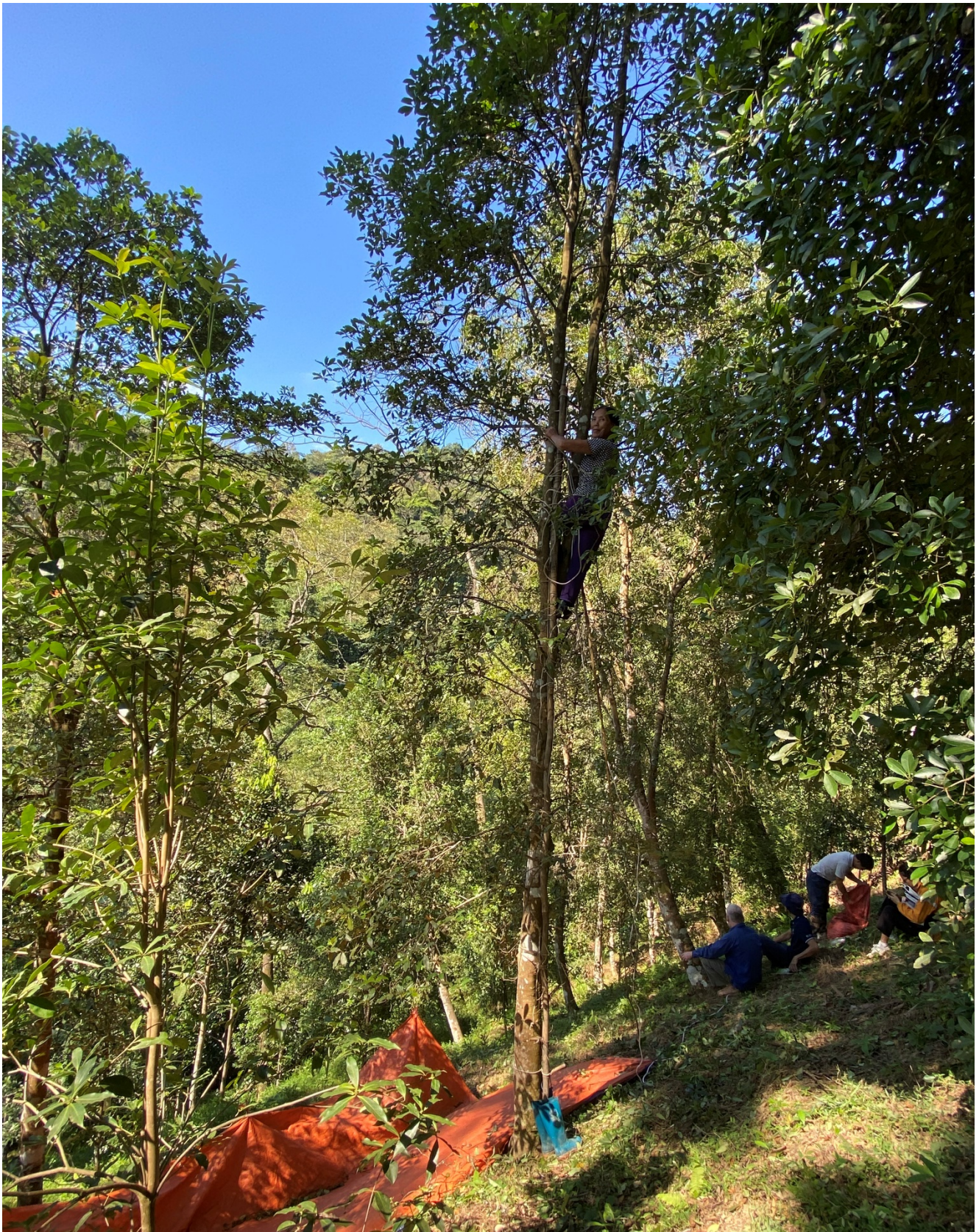
Photo: Lam Thi Hoa of Ban Vien village harvesting star anise fruits. Attached to the tree by a rope, she uses a long stick to dislodge the fruits, which fall onto the tarpaulin spread out below. Whilst she is a highly experienced tree climber and was unconcerned about falling, such harvesting practices nevertheless bear some risk.